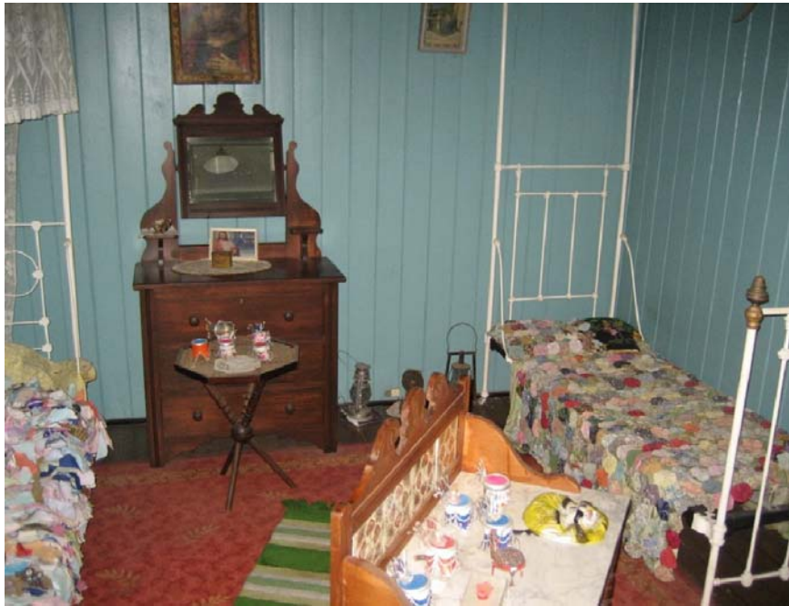
The children's rooms have stayed exactly as they were