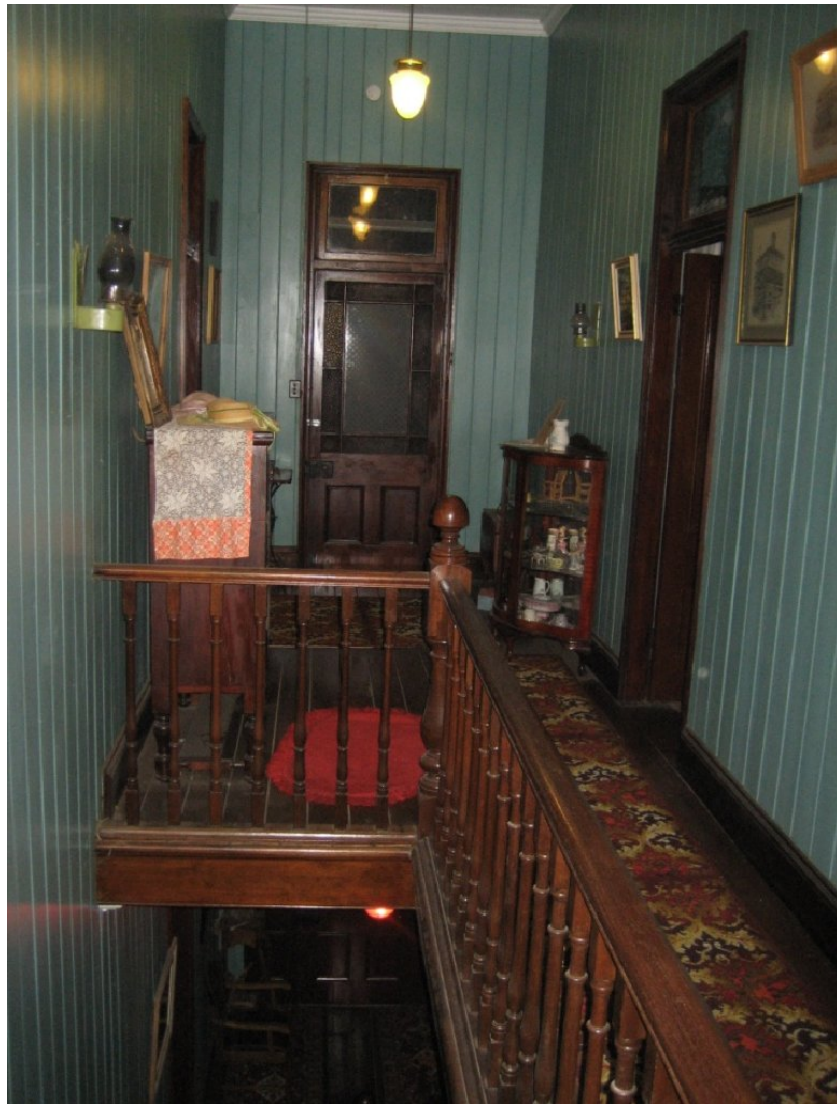
The house contains the very original fixtures and fittings