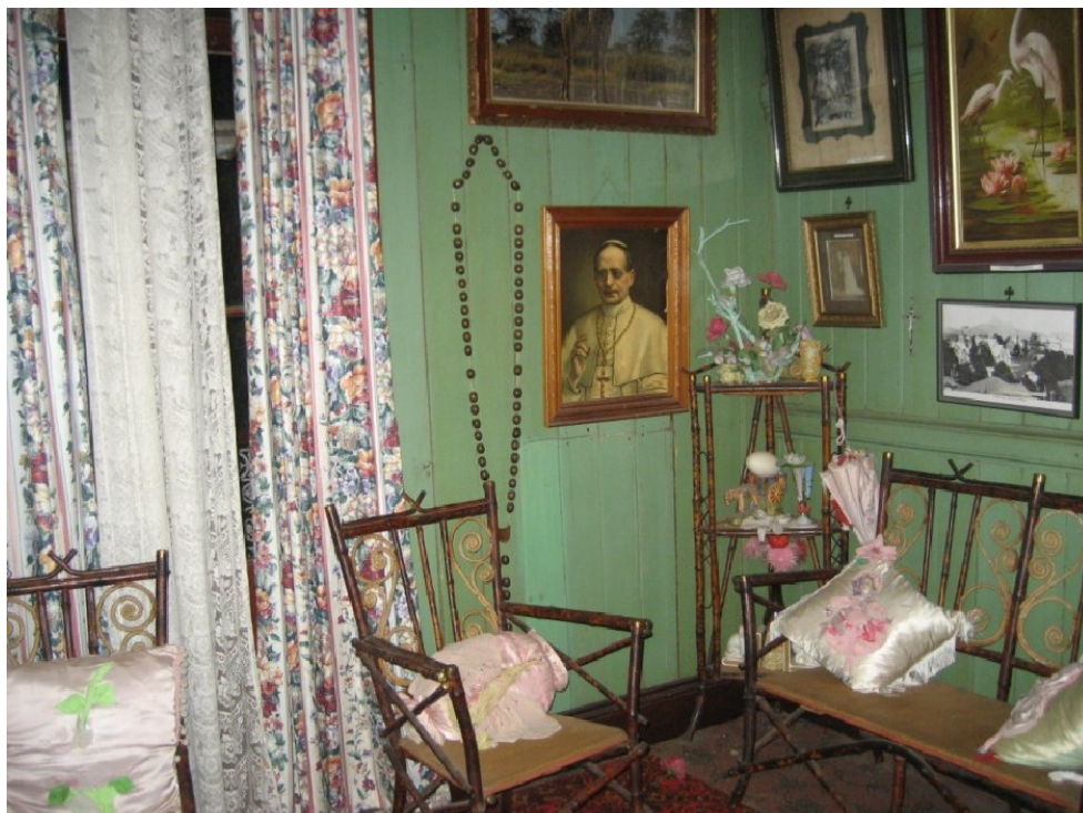
Rooms contain personal items of the family from early 1900's as well as personal craftwork